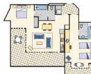
Floor plan shown is the Two Bedroom Apartment.